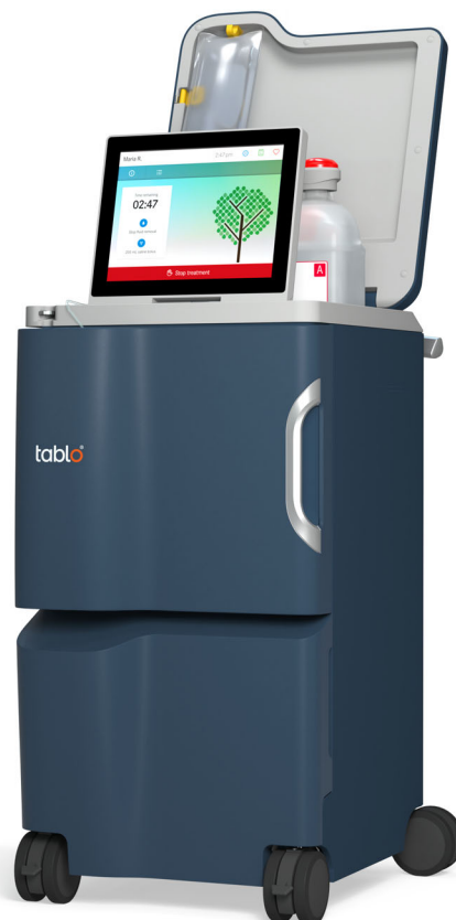
Figure 1 Tablo hemodialysis system. [Color figure can be viewed at wileyonlinelibrary.com ]

The objective of the current investigational device exemption (IDE) trial was to evaluate the safety and efficacy of Tablo when used in-center managed by trained health professionals and in-home by trained patients or a care partner.